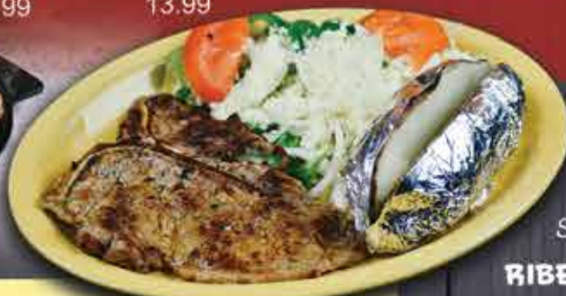
STEAK SANTA FE