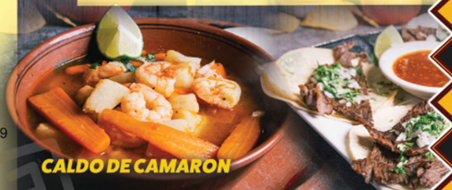
CALDO DE CAMARON