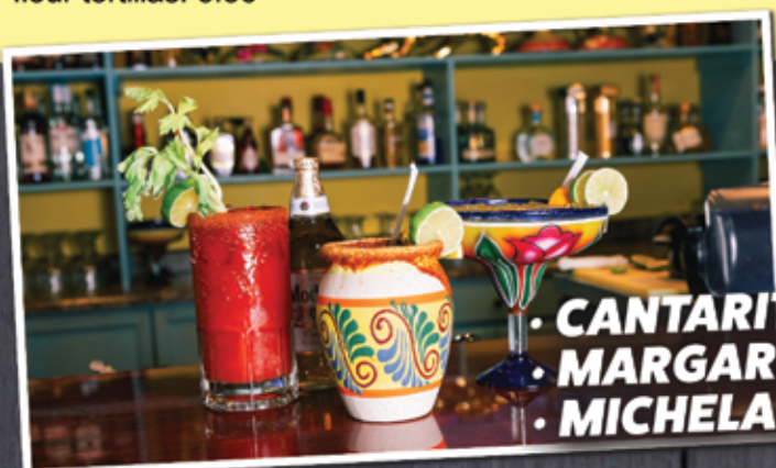
• CANTARITOS • MARGARITAS • MICHELADAS